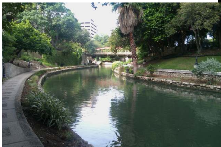
The famous Riverwalk wound its way through San Antonio and into our hearts.