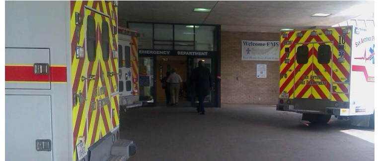
Baptist Hospital ED welcomes EMS!

Courses and Educational Events may be added or cancelled after publication. For the most up-to-date course information, go to the national ENA web site and click on Courses & Education, then CATN-ENPC-TNCC, then open the map and click on California. Please confirm dates with course directors.