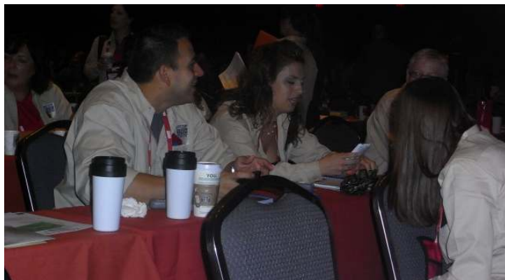
Delegates at General Assembly